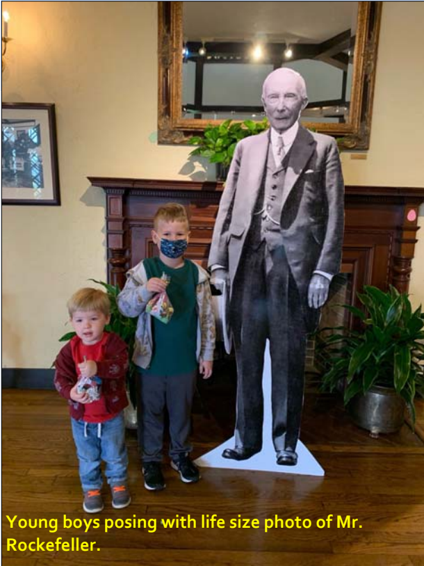
Young boys posing with life size photo of Mr. Rockefeller.