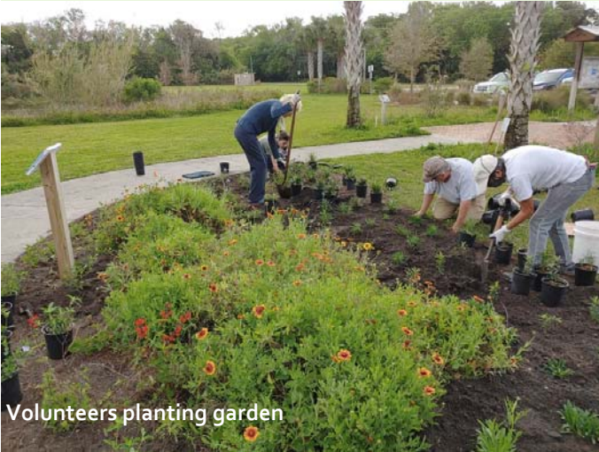
Volunteers planting garden

Just in time for spring! On Friday, March 19, more native flowers were planted in the EDC Wildflower Demonstration Garden. Special thanks to gardeners from the Ormond Beach Community Gardens and members of the Paw Paw Chapter of the Florida Native Plant Society. They volunteered their time and expertise to make it happen!