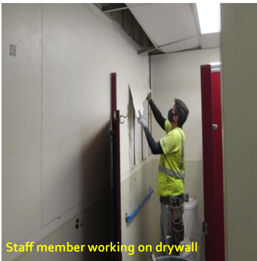
Staff member working on drywall

The main lobby restrooms had some dry-wall work done and have been repainted. New shelves were installed in the concession stand, and they now match the newly installed counter-top. This work will help the PAC look its best for the Center's future reopening.