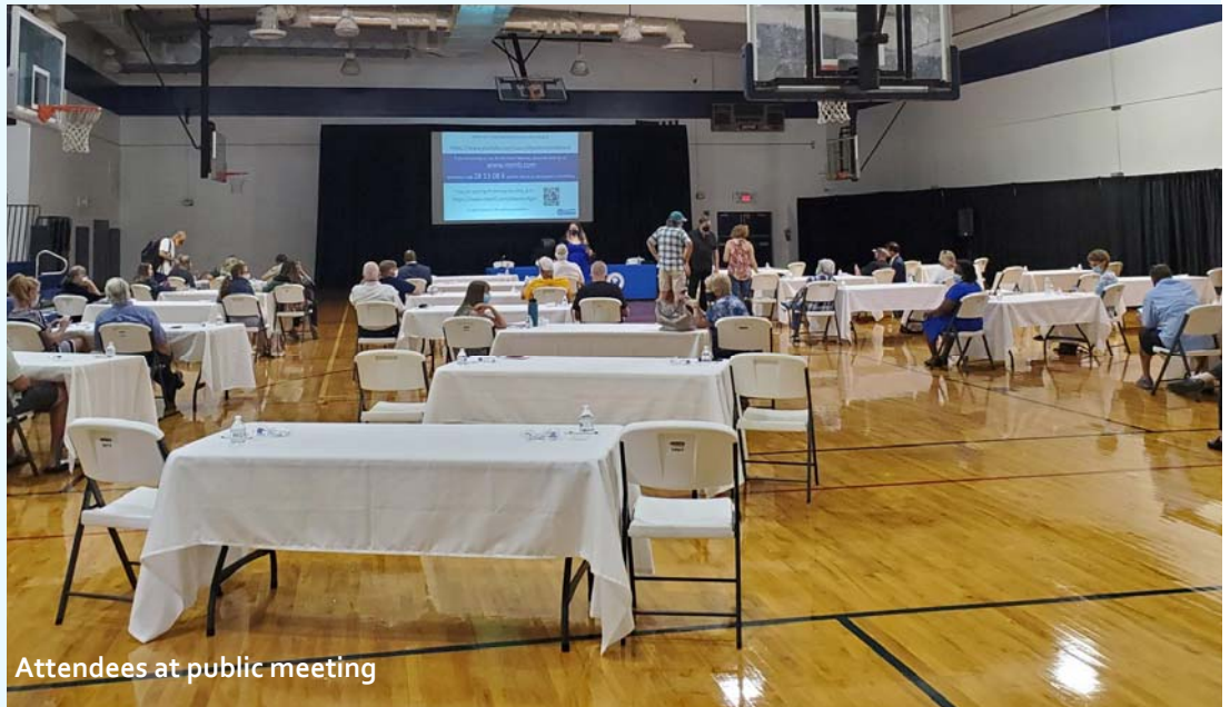
Attendees at public meeting

Barth Associates presented an overview of the project, and offered insight regarding the statistically valid survey, as well as the electronic survey. A Menitmeter polling exercise was