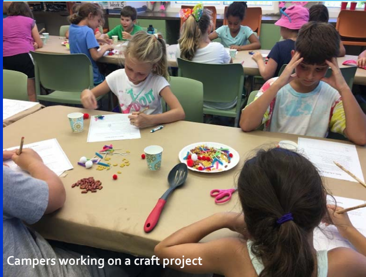
Campers working on a craft project

“Where did the summer go?” That’s what staff has been asking this week. This was the final week of Enviro Camp. This week’s theme was “Take Two!” which represents a week of all the fun-filled activities that were done throughout the summer.